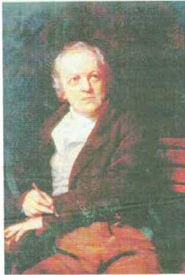
William Blake by Thomas Phillip

WILLIAM BLAKE fans are staging a festival next week to celebrate Felpham's most famous residents.