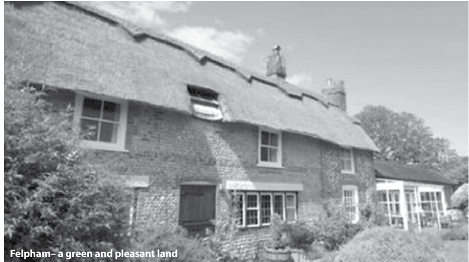
Felpham – a green and pleasant land