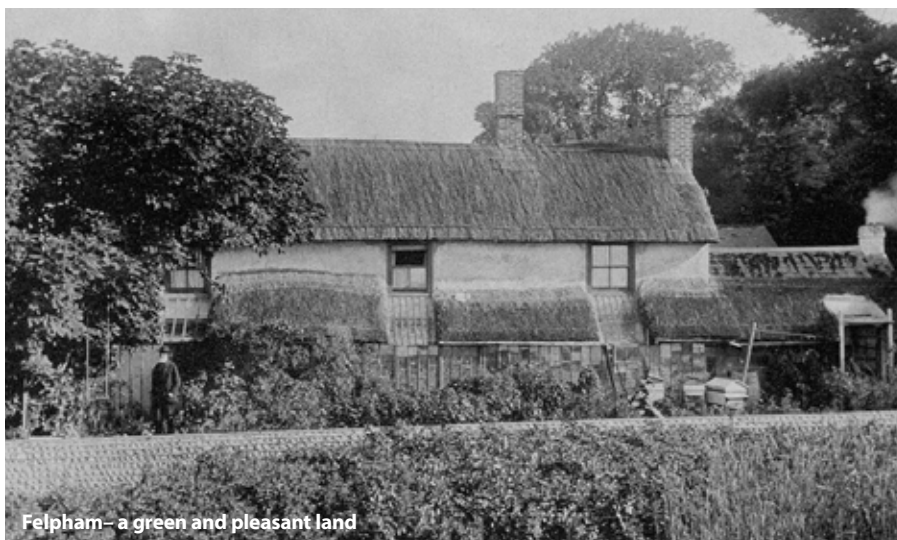
Felpham – a green and pleasant land

The campaign to purchase this important heritage site is launched at the Houses of Parliament